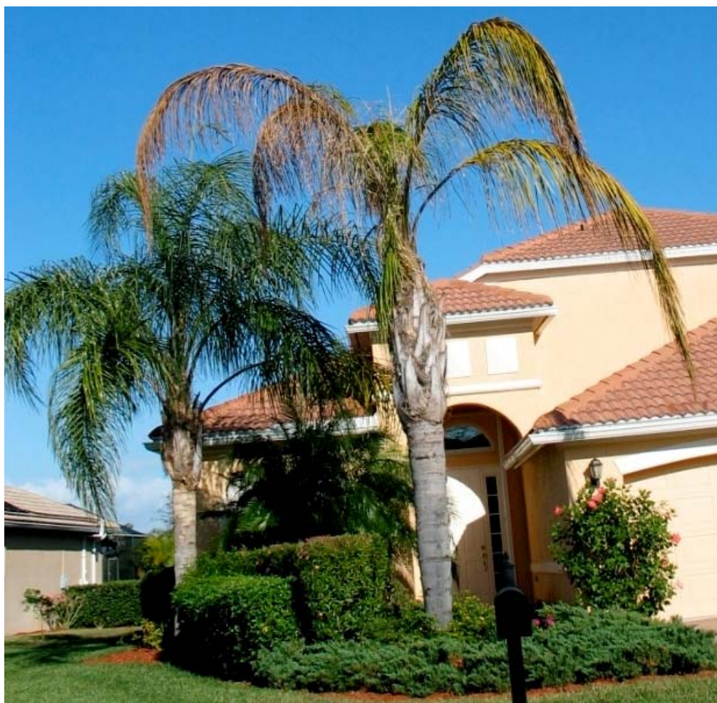
A seemingly healthy palm on the left and a Fusarium affected palm on the right