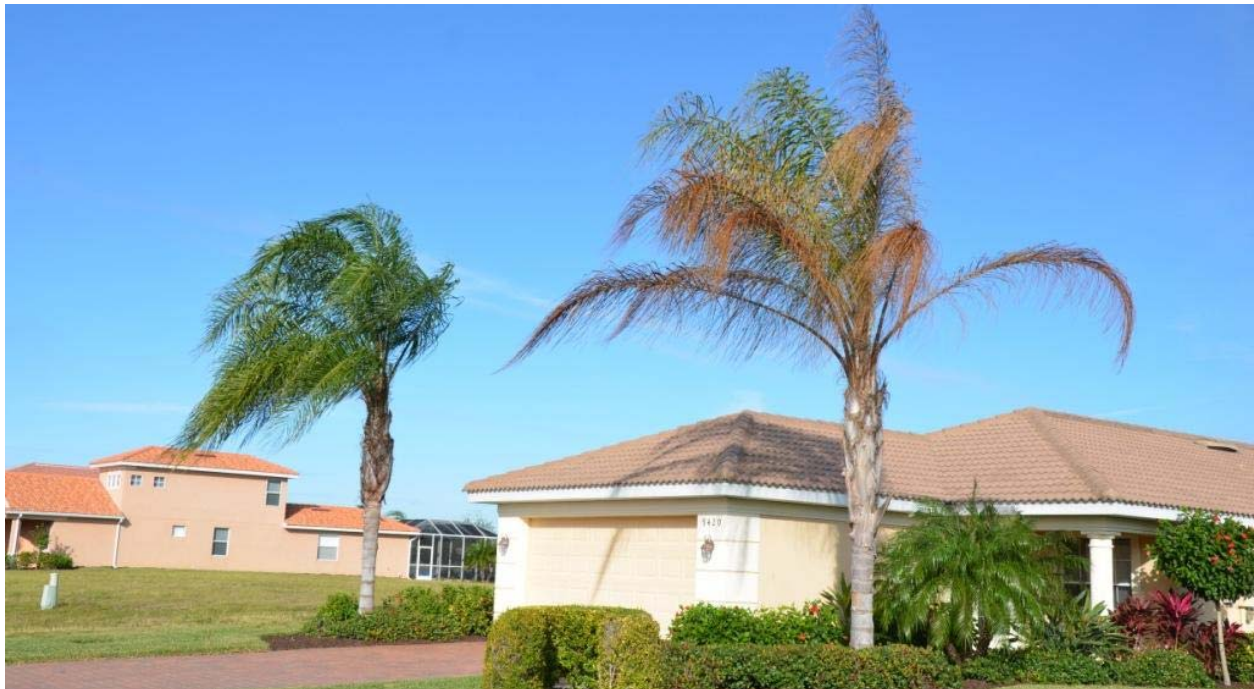
A seemingly healthy palm on the left and a Fusarium affected palm on the right

Once the palm is affected by this disease there is no cure. Currently, there is also no method for preventing this disease. Once the disease is established, it is thought that it may be transmitted from palm to palm by leaf-pruning equipment. Pruning should be restricted to removal of dead or dying fronds only. Severe pruning weakens the palms and may increase risk of pathogen transmission. Equipment used to remove leaves from an infected palm will have fungus-infested leaf material (wood dust, plant sap) remaining on the blades. If equipment is not cleaned and disinfected, the next queen or Mexican fan palm pruned by this equipment will be exposed to fungus-infested leaf material. If in a landscape some palms are symptomatic, be sure to disinfect the pruning tool between each palm whether or not the palm shows symptoms of the disease. Some symptomless palms may have already been infected and are capable of spreading the disease if equipment used for pruning them is not properly sanitized.